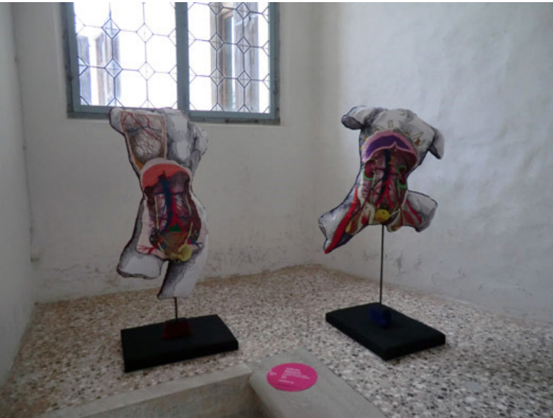
Valerio Niccacci, 'Scucimi'

recovery tissue, stained with strokes of indigo colour on the back, which appear on the front, suggesting traces of words and drawings.