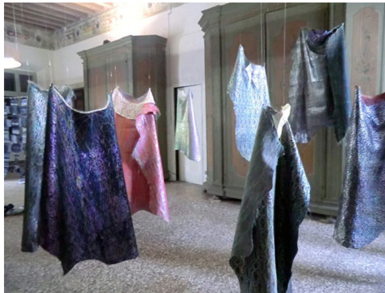
Chen Ying-Ting, '12 Different Collar Skins'

The Jury also conferred the 'Galimala Award', presented