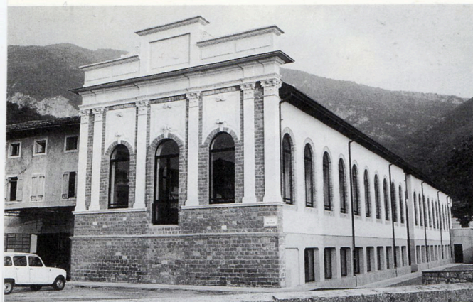
Ex-Filanda, former spinning mill in Maniago, venue of the exhibition