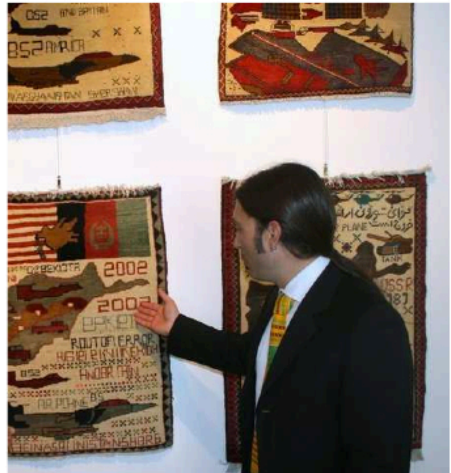
Presentation of Afghan carpets

the title "Stamp on War". A documentary film "Inside Kabul" and the book "Guerre a Tappeto" (Carpet Wars) were also presented.