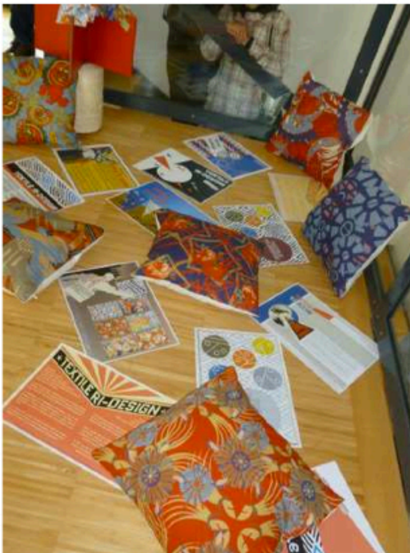
Digitally designed cushions by students of AFOL Moda

The " Textile Ri-Design new collection " consists of a series of cushions printed by "Clerici Tessuto" company that have been positioned on Soviet style posters lying on the floor created by the students. "Casa Minea" jewels, which are made of fabrics enclosed in plexiglas, have been placed on a table along with the video showing the latest projects, and an album containing some designs ready to be put into production. The project was promoted by Afol Milano with Afol Moda and the Italy-Russian Association.