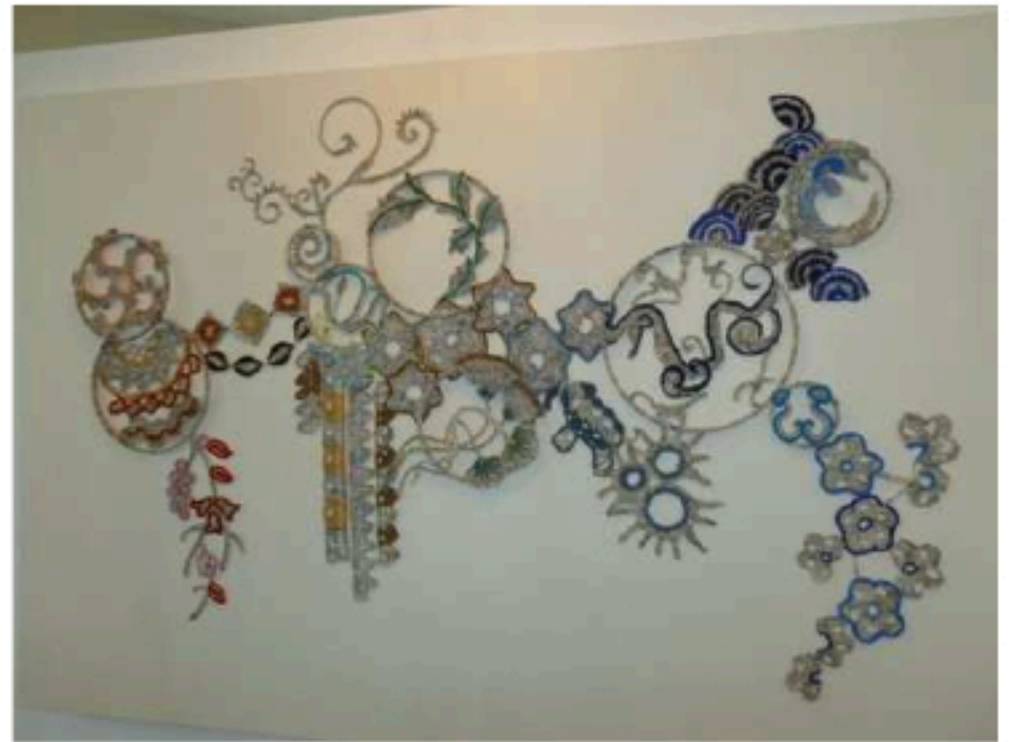
' The world is assembled by a thread' by of Chia-Shan Lee, Taiwan

Lucia Travnik (Hungary) presents top quality black and white photos arranged in four panels that picture an artistic and intercultural interpretation of the bondage practice.