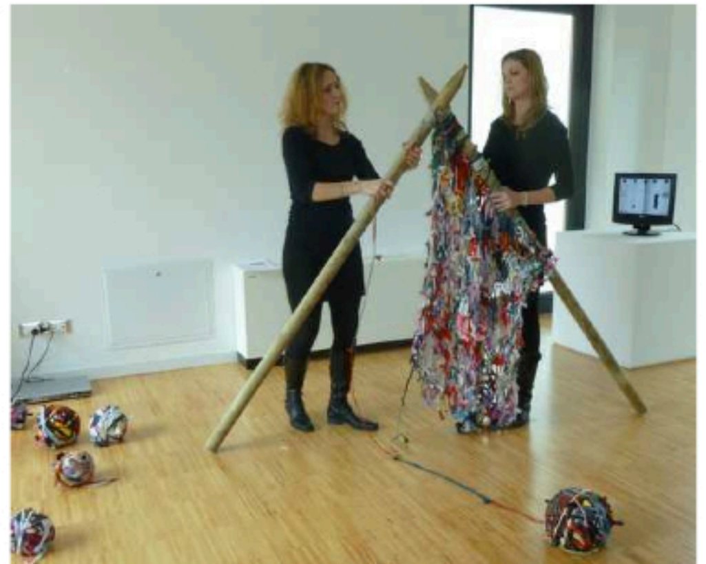
Large knitting by students of Accademia di Belle Arti Di Bologna

The guests enjoyed a buffet meal at this venue and fortunately the sun was shining so we were able to eat outside while networking.