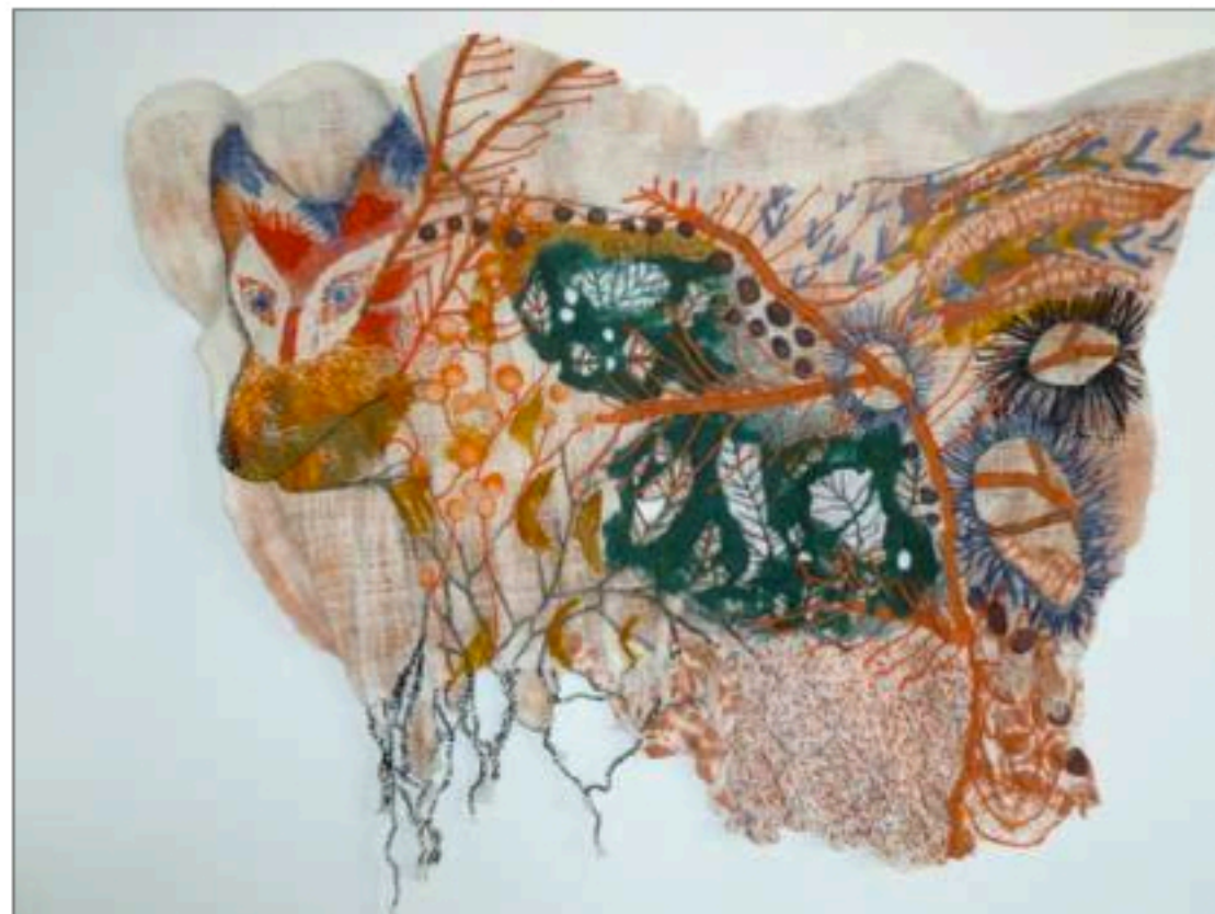
God of Fox by Mariko Kobayashi, Japan

Chia-shan Lee (Taiwan)'s "The world is assembled by a thread" is a technically consummate sculpture made of newspaper yarns using crochet. Santanu Das (India) presents a gigantic sari (8.40 mt. long by 1.60 mt. high) resulting from the patchwork of many saris in this way mixing different Indian cultures.